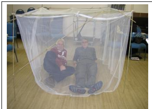
Net tied onto framework note net touches ground & tucked under mattress