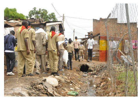
Scouts walk through the community to create awareness

The following is extracted from the report back from the Ugandan Scouts.