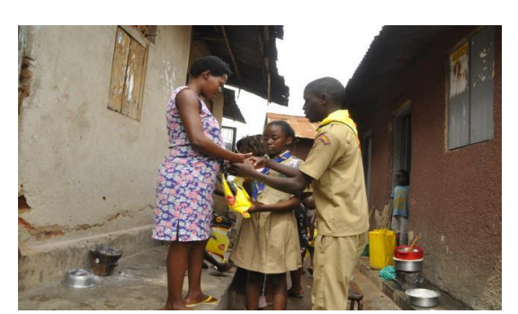
Scouts brief and hand over the mosquito net

"The Uganda Scouts Association and Treasure Life Center (TLC), a youth group located in the Kampala slum of Kamwokya did a pilot roll out in the campaign against malaria. Expectant Mothers and Children below the age of 5yrs were selected due to their vulnerability to Malaria which can cause them early deaths or Cerebral Malaria.